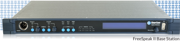
FreeSpeak II Base Station